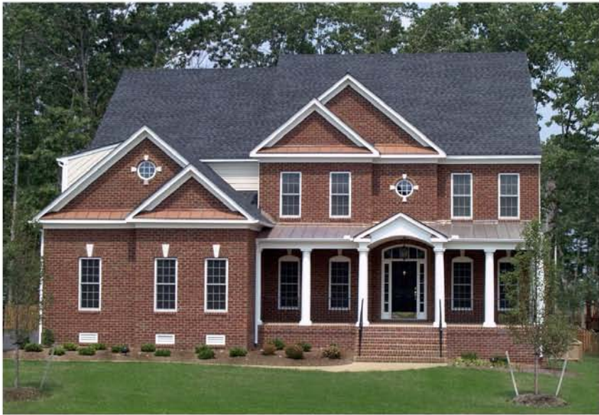
ELEVATION "C" SHOWN