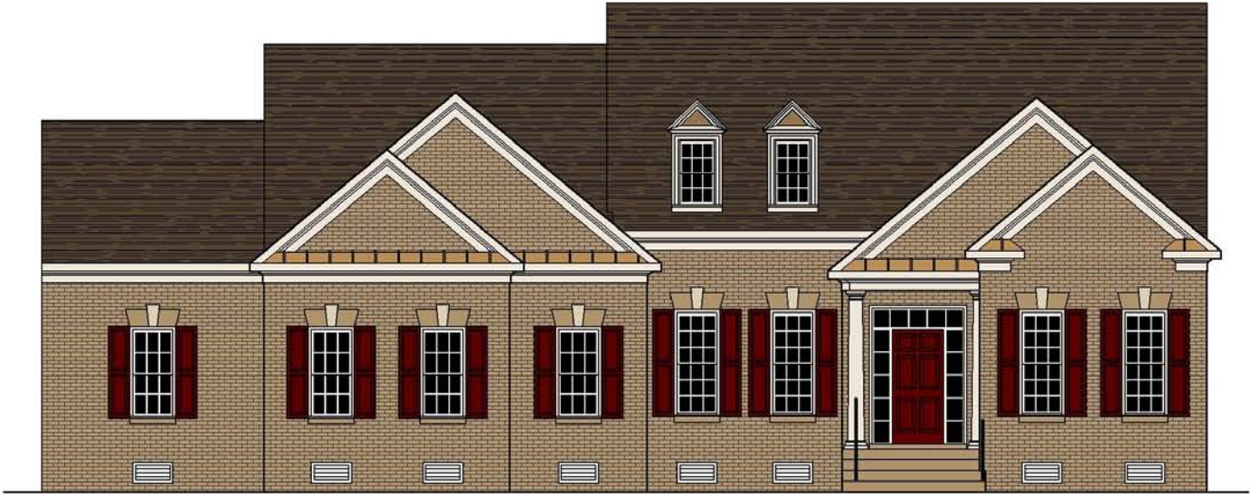
ELEVATION "A" SHOWN