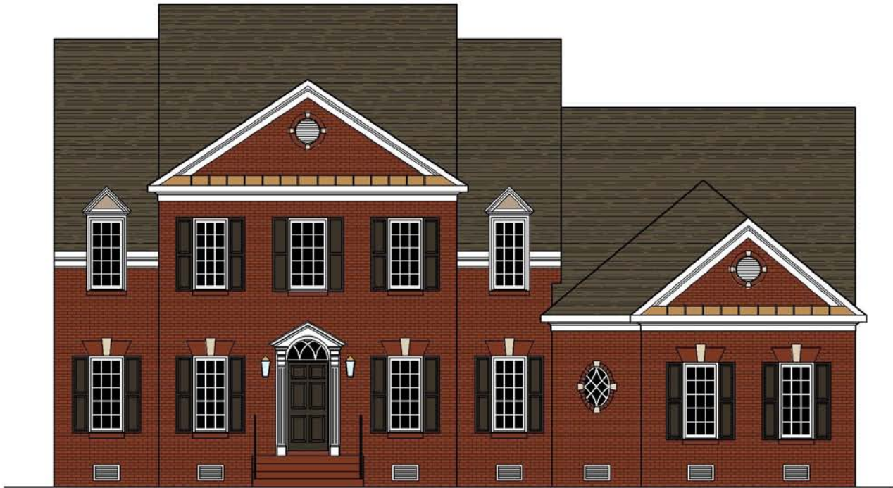
ELEVATION "A" SHOWN