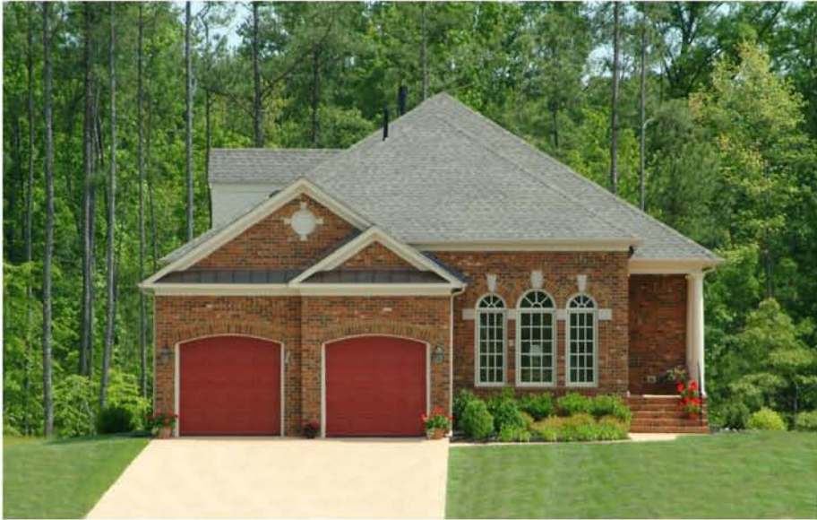
ELEVATION "F" SHOWN