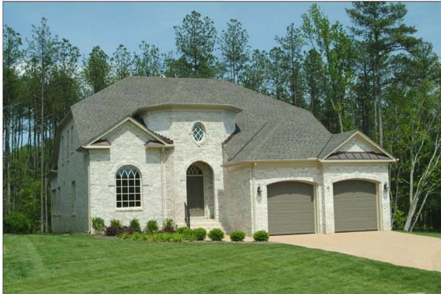
ELEVATION "C" SHOWN