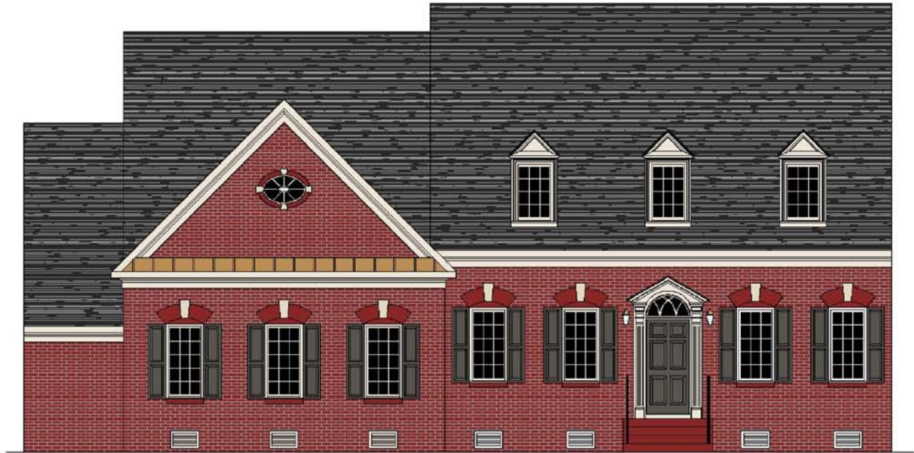
ELEVATION "A" SHOWN THE HEDGESTONE