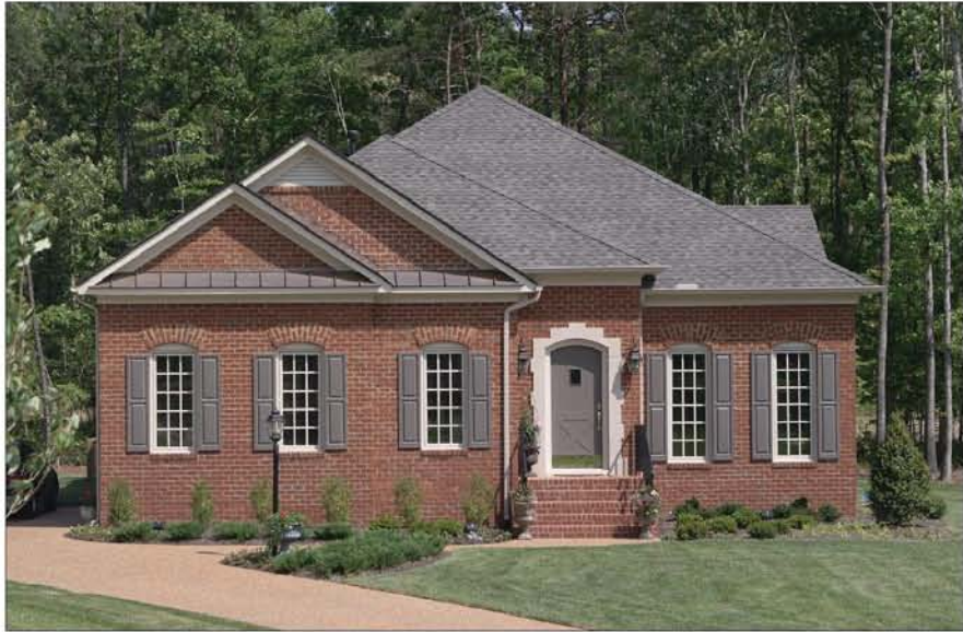
ELEVATION "D" SHOWN