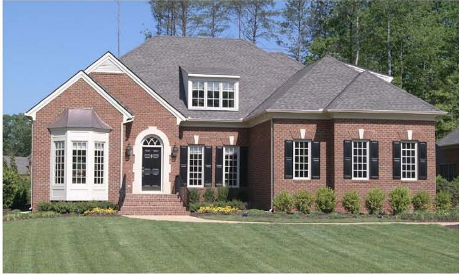
ELEVATION "A" SHOWN