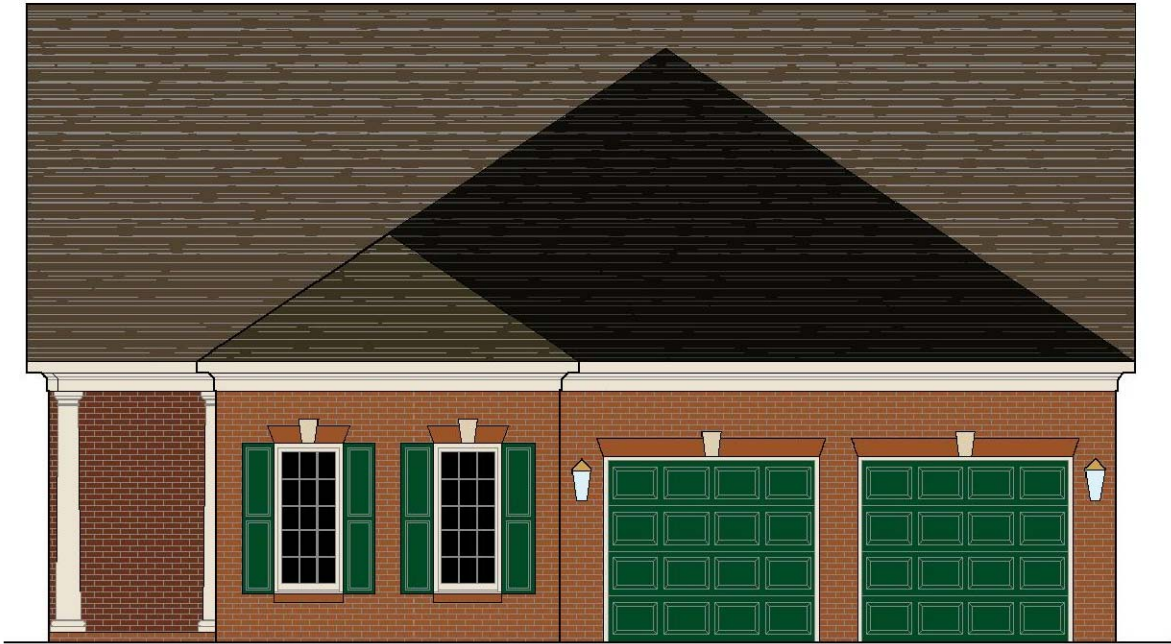
ELEVATION "A" SHOWN