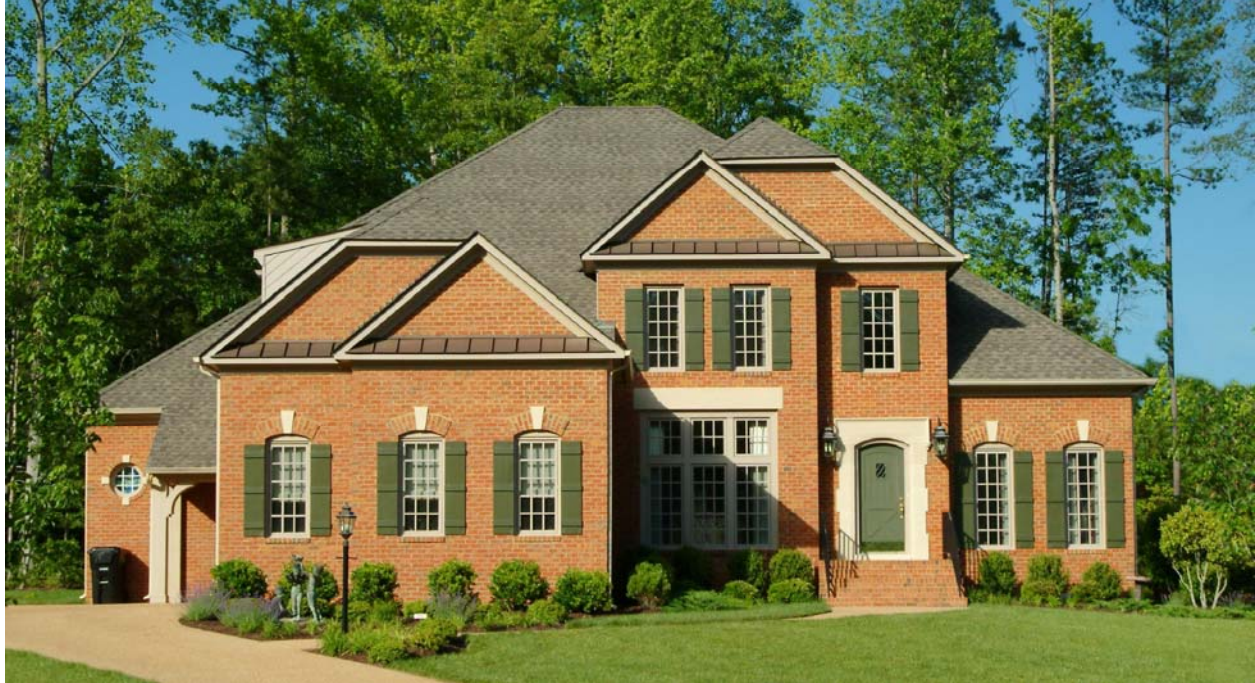
ELEVATION "B" SHOWN