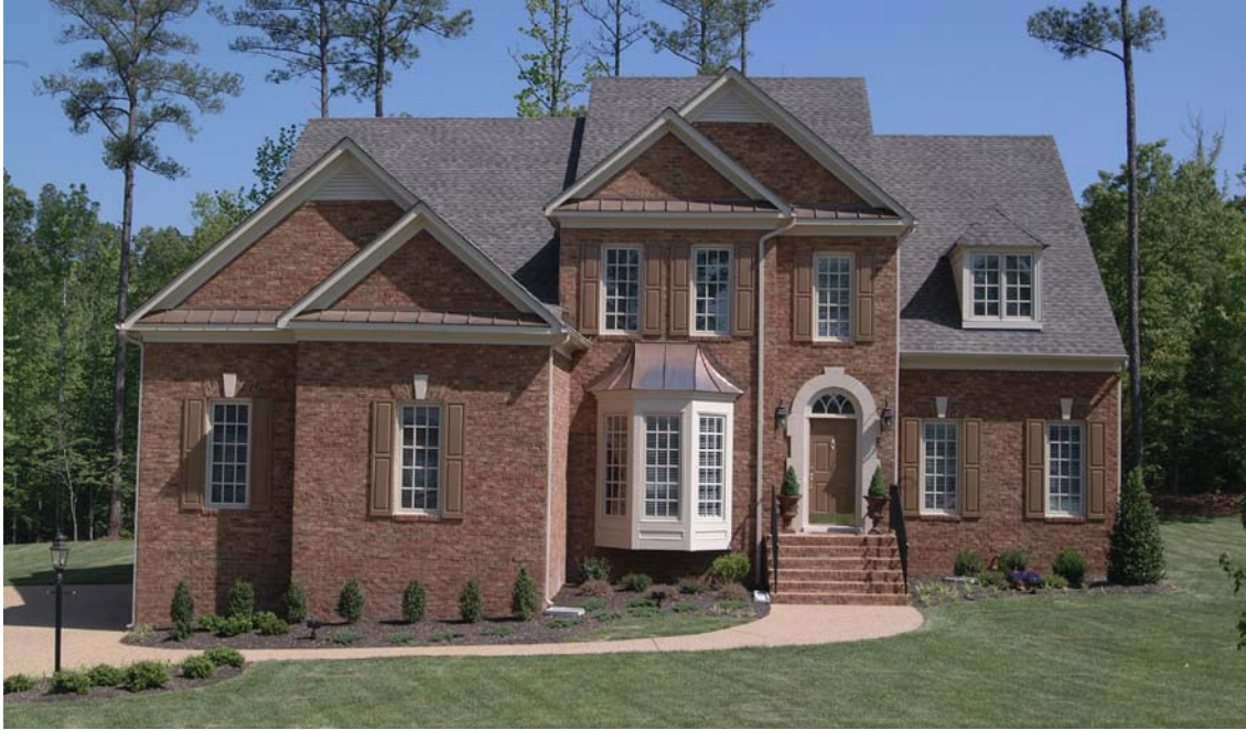
ELEVATION "A" SHOWN