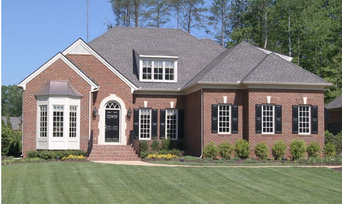
ELEVATION "A" SHOWN