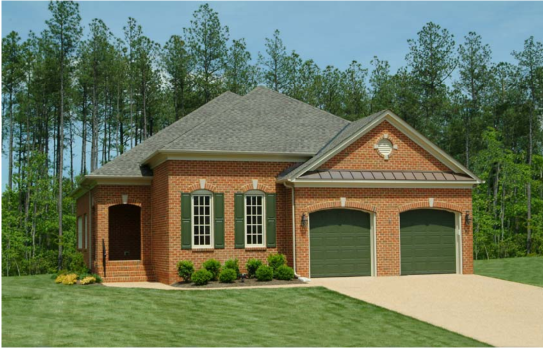
ELEVATION "G" SHOWN