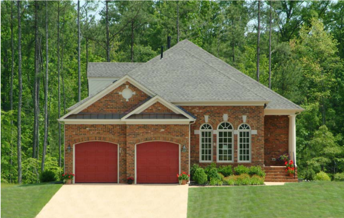
ELEVATION "F" SHOWN THE BRIARSTED