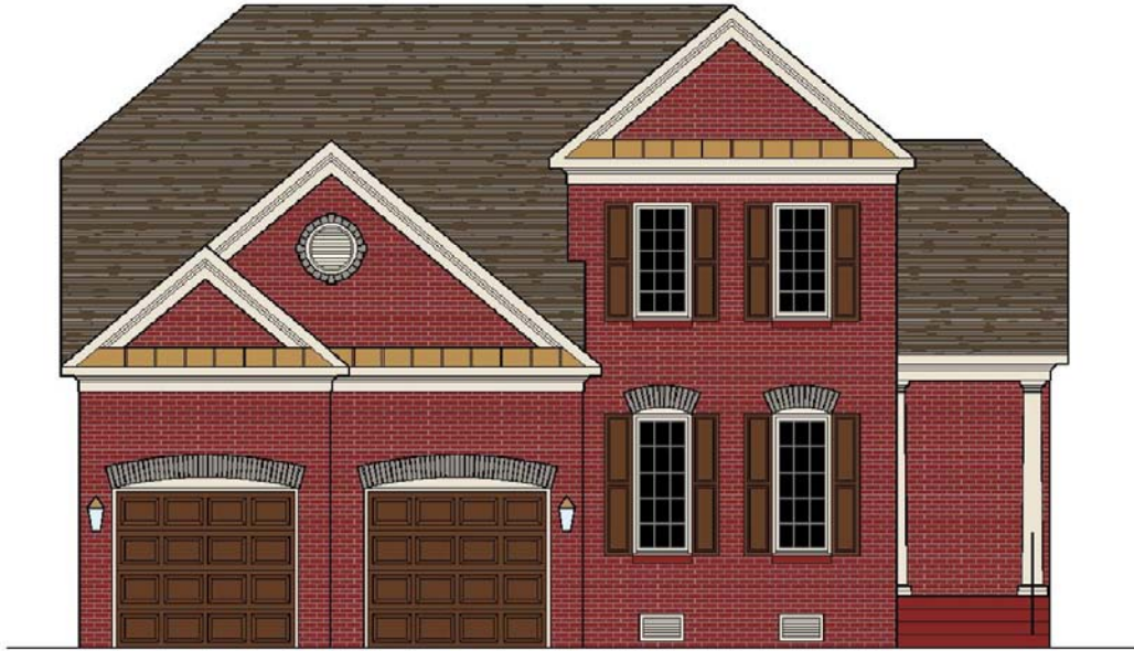
ELEVATION "A" SHOWN