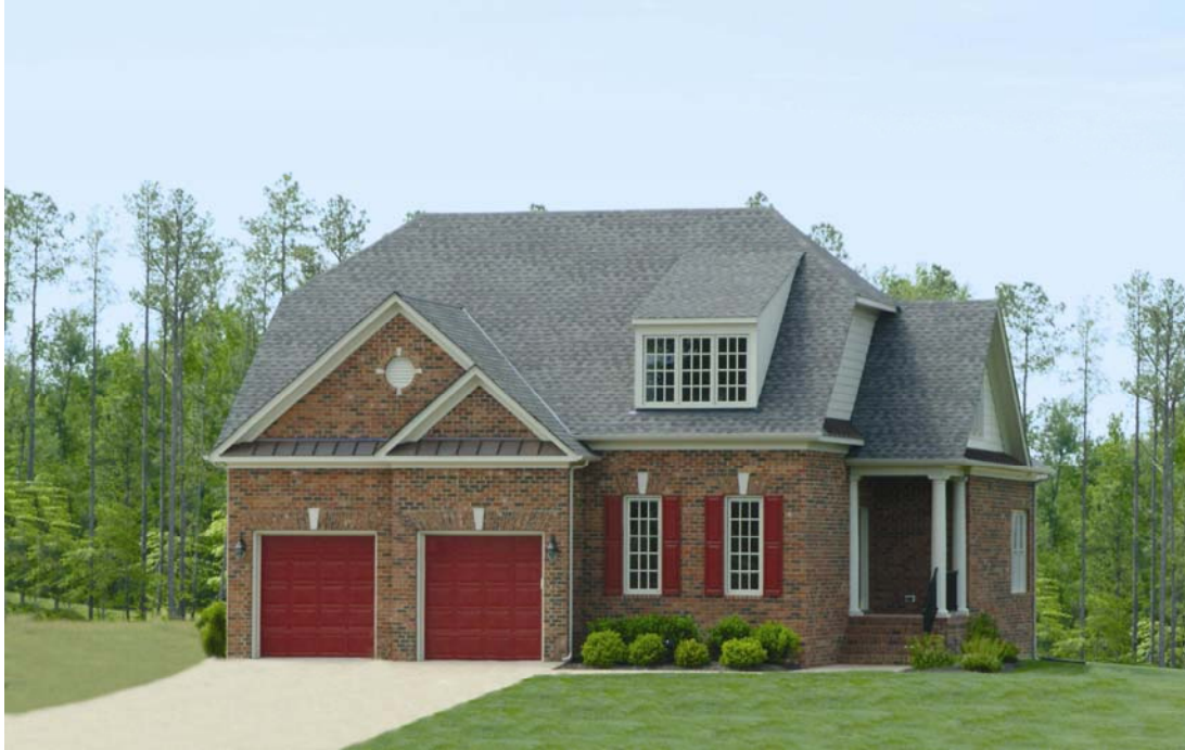
ELEVATION "C" SHOWN