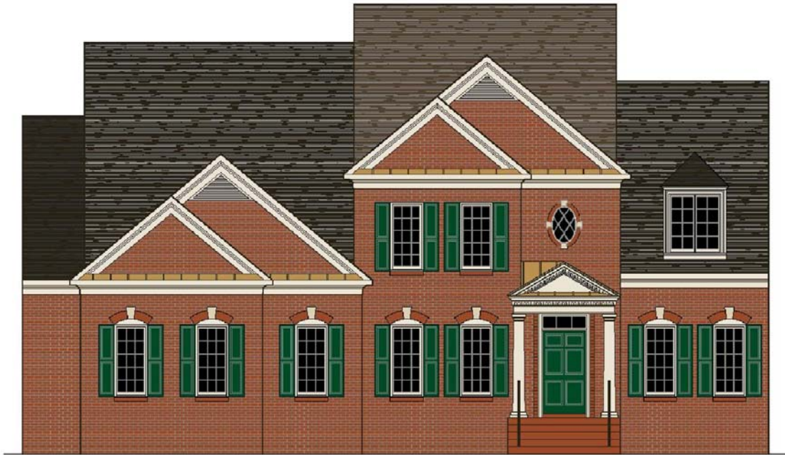
ELEVATION "A" SHOWN