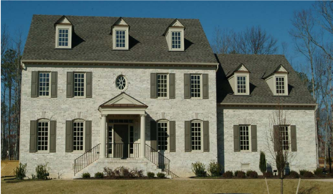
ELEVATION "B" SHOWN