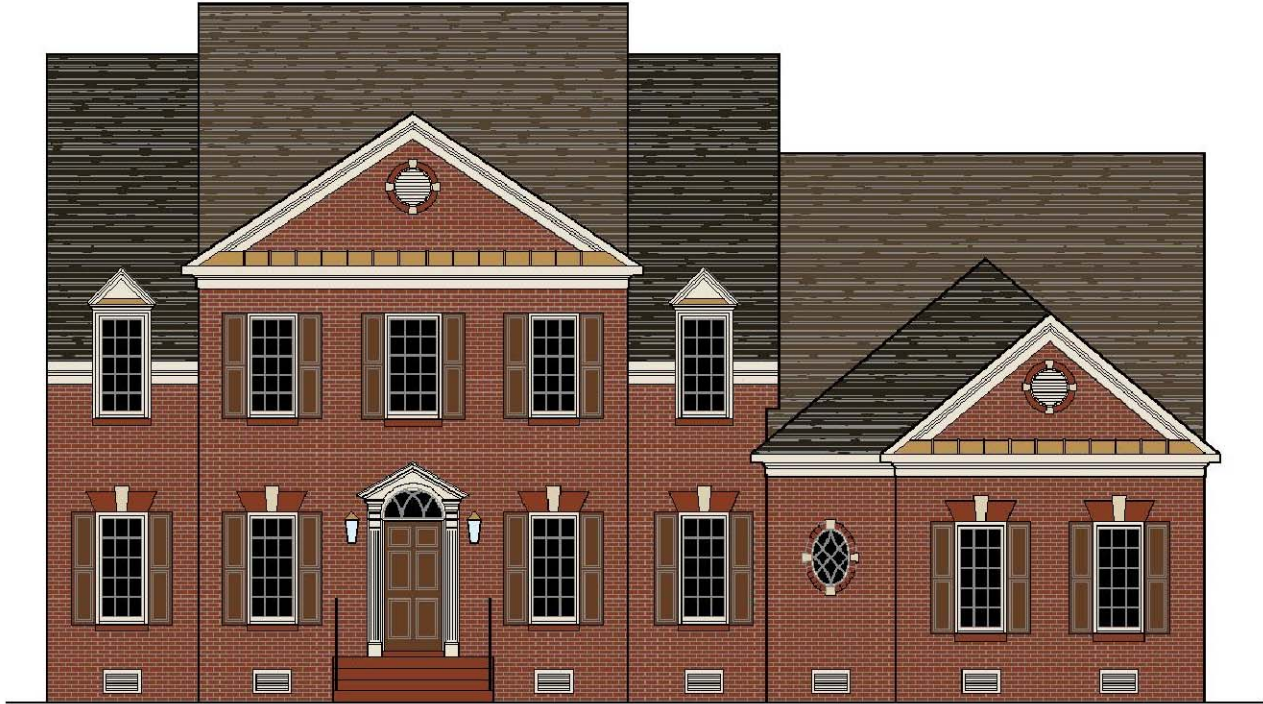
ELEVATION "A" SHOWN