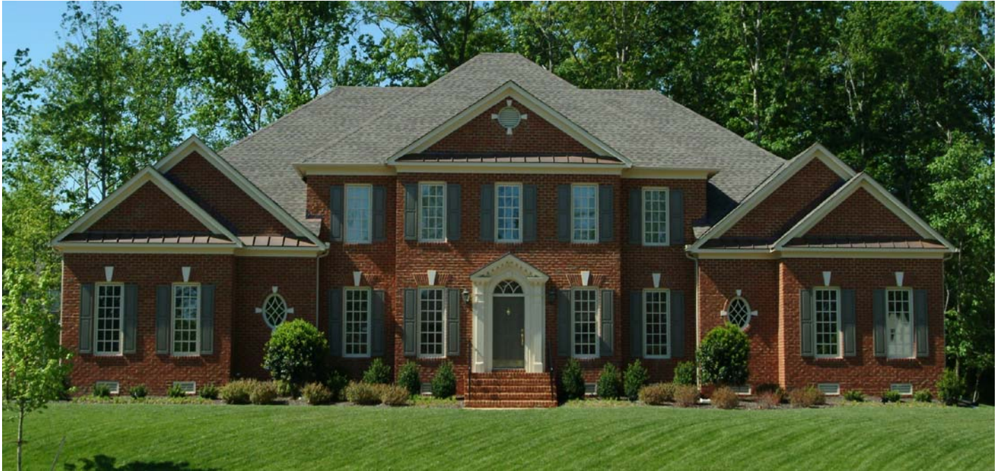
ELEVATION "A" SHOWN