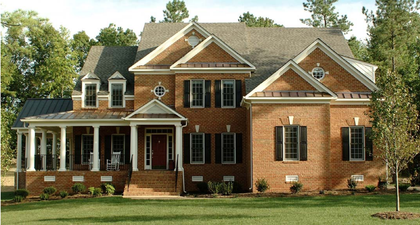
ELEVATION "C" SHOWN