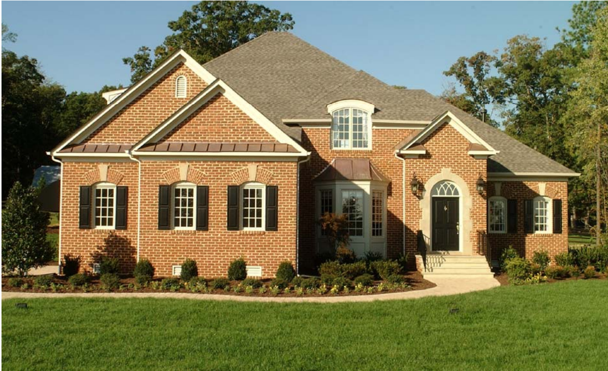
ELEVATION "A" SHOWN