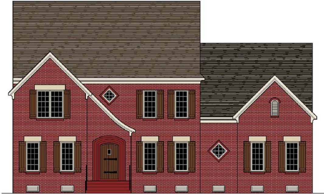
ELEVATION "C" SHOWN