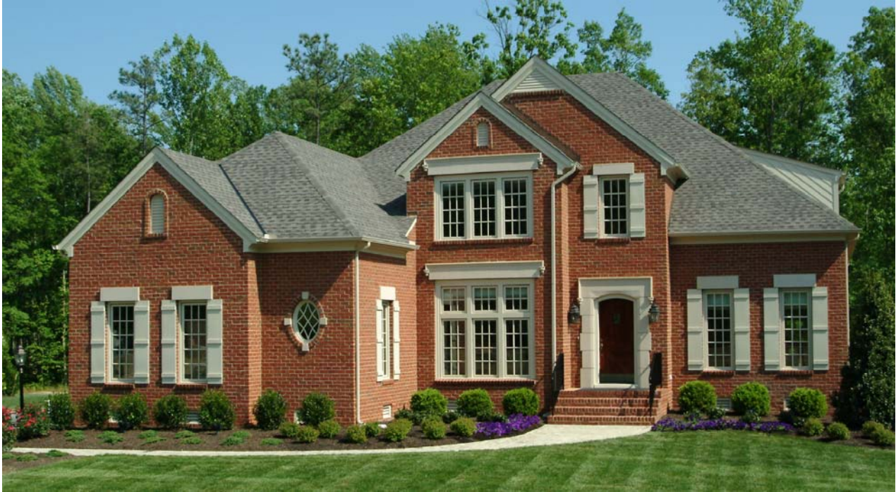
ELEVATION "C" SHOWN