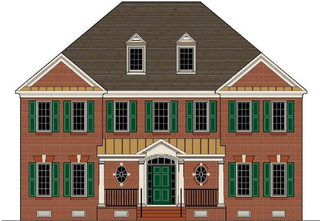
ELEVATION "A" SHOWN