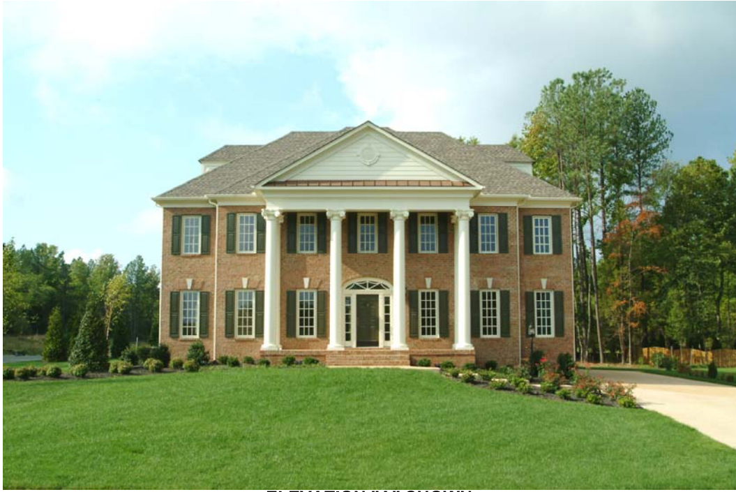
ELEVATION "A" SHOWN