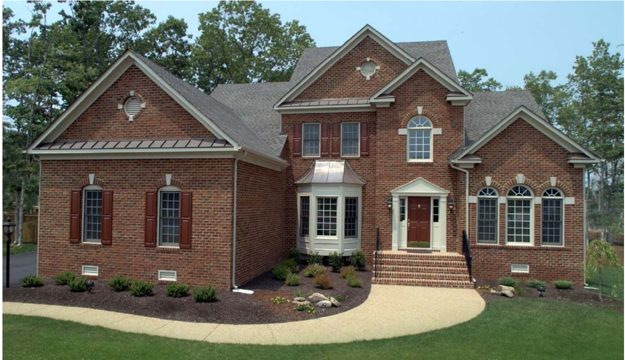
ELEVATION "A" SHOWN